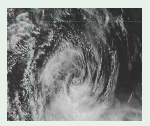
Episode 1 - The shot over the bow (Ex TC Diabolical)

Some ground floor residents had no flood insurance on their contents for similar reasons (considered unnecessary).